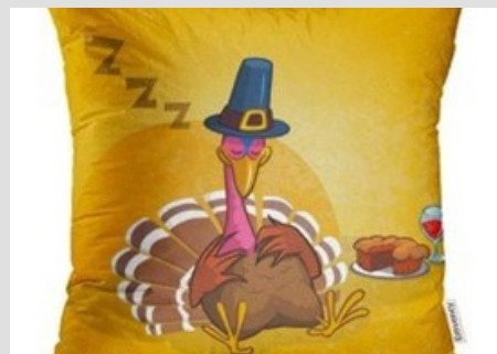
Turkey really makes you sleepy?